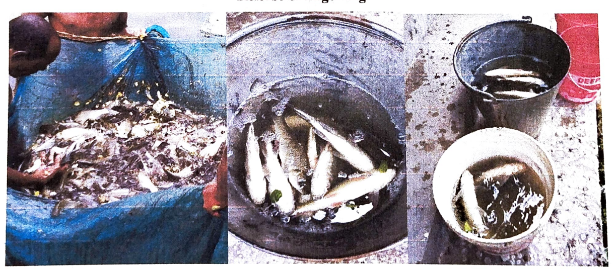
Inspection, Sampling and rearing

Co-ordinator I Q A C Gushkara Mahavidyalaya Gushkara Purba Bardhaman