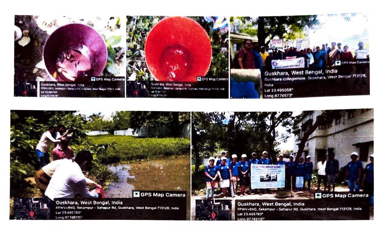
Larvicidal fish culture for preventing mosquito-borne diseases including Dengue