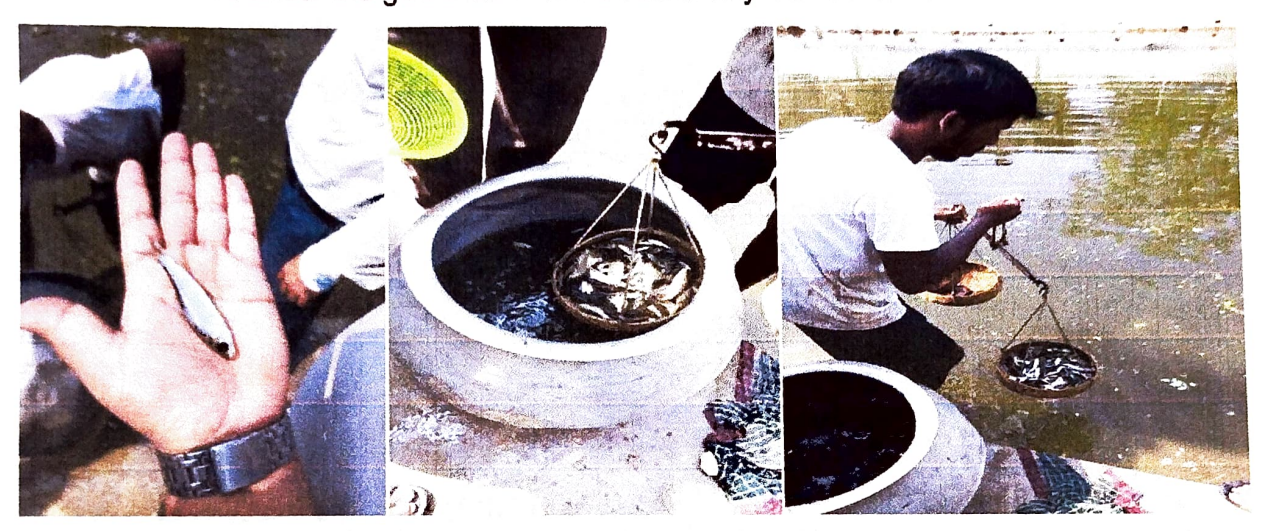
Release of fingerling

Pisciculture in pond wetland is carried out with the latest scientific technologies to implement natural food and low priced self-made feed system in semi-intensive polyculture. The protocol for piciculture was initially designed and developed by the Department of Zoology, Gushkara Mahavidyalaya and, later on, the Research & Development Cell, Gushkara Mahavidyalaya has provided their scientific advice and expertise since 2022. These niche technologies and knowledge systems have extended to the students as well as local fish farmers under the guidance of our scientifically trained faculties.