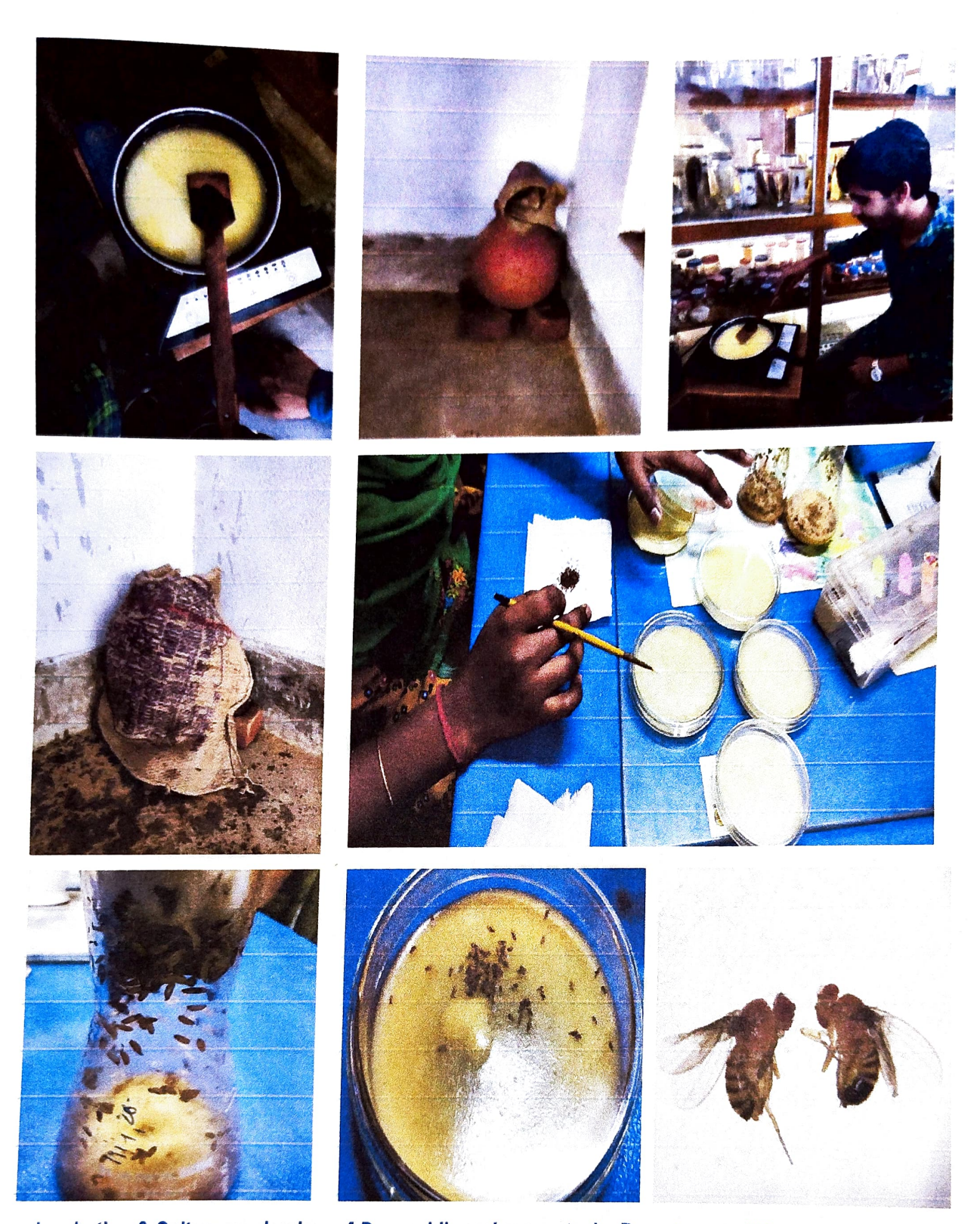
Incubation & Culture mechanism of Drosophila melanogaster by Department of Zoology in Animal House of Gushkara Mahavidyalaya

Co-ordinator I Q A C Gushkara Mahavidyalaya Gushkara, Purba Bardhaman