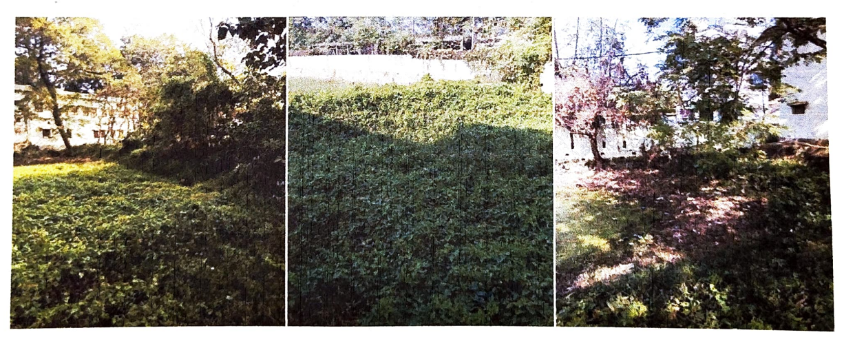
Habitat conservation for sustainable development

Co-ordinator I Q A C Gushkara Mahavidyalaya Gushkara, Purba Bardhaman